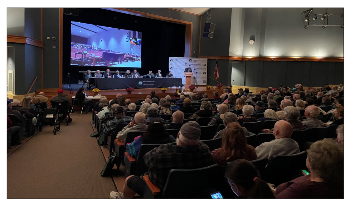
Bath District Members at the Campbell-Savona High School auditorium.